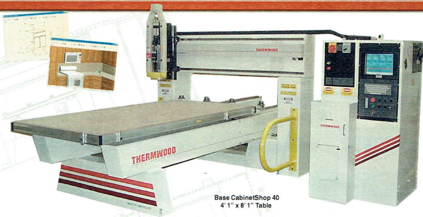
Base CabinetShop 40 4' 1" x 8' 1" Table